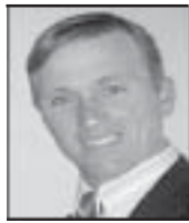
State Rep. Ian Emery